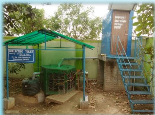
1500 litre field scale bioelectric toilet at IIT Kharagpur

Thus, budding researchers and research scholars working in this field will get an opportunity to gather invaluable knowledge from the workshop, which will aid them in the future to make substantial contribution in this field. Interaction with these leading edge researchers/mentors can also lead to various multi-national collaborative projects, thus leading to a symbiotic association between the research groups. A brainstorming session at the end of the workshop is also scheduled, which would focus on the challenges faced by various researchers to scale-up this novel technology of bioelectrochemical system and methods that should be adopted to circumnavigate these bottlenecks.